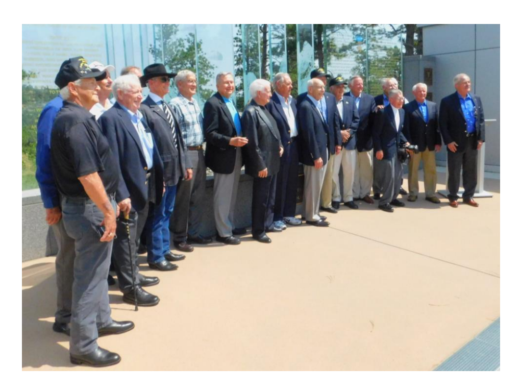
F-105 pilots who gathered at the Air Force Academy on 7 Aug 2018.